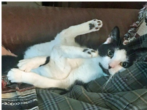
First Foster Fail: Roman

"Our first foster was a black and white kitten named Roman, perhaps six months old, who was just terrified of us! He hid from me, but slowly I managed to win his trust. Some milestone moments were when Roman tentatively stepped out of hiding to take a treat from my hand, chased a wand toy across my legs as he forgot to be frightened, fell asleep while leaning against my leg, and finally purred contentedly in my arms. After that rewarding process of socializing a fearful cat, I was hooked! So, now I often foster cats and kittens who must learn to trust humans in order to be adopted."