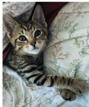
Forgotten Cats Adoptee: Cato