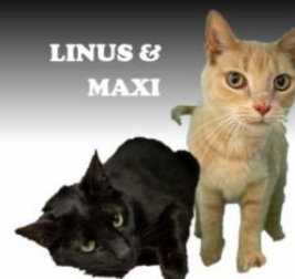
LINUS & MAXI Linus (orange) and Maxi (black), adopted 8 years ago but brought back because of allergies in the home!