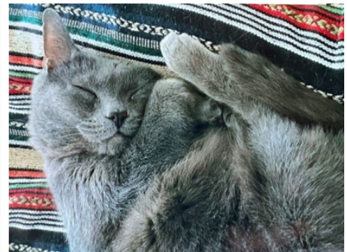
Second Foster Fail: Ted