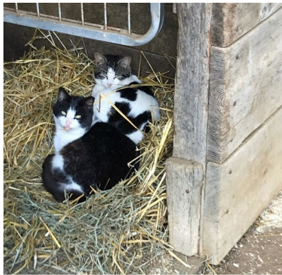
The Barn Cats: Luke and Leia