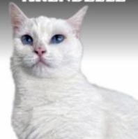
ARENDELLE Pretty blue eyes loves to be held, but she's deaf!