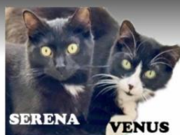
SERENA VENUS Above, these sisters have been at the Willow Grove clinic since February! They're a bonded pair!