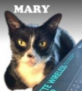
MARY Mary (under a year old) and Sydney (6-8) are both FeLV+. They must be "only cats" or with another FeLV+ cat.