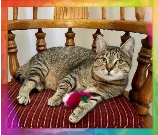
Jezzy (FCID# 05/14/2020 - 49) Tabby • F

Jezzy (FCID# 05/14/2020 - 49 Foster) is a sweet ~1.5 year old Brown Tabby who was a Mommy to 3 beautiful little boys who have all been adopted. She has been in foster since she arrived with her babies and is excited for her turn to find her forever family.