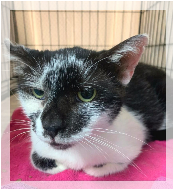
Inky before his big trip

On September 18th , we all came together to save lives! Six Philadelphia area rescues ( PURR, Project Meow, Helping Paws, NEPA, and Lucky Dawgs ) all jumped at the opportunity to send some of their adoptable cats to our new shelter partner in VERMONT ! We met bright and early ( 5am to be exact ) to send 20 lucky Philadelphia cats off to a better life. This transport allows these rescues to intake more homeless cats!