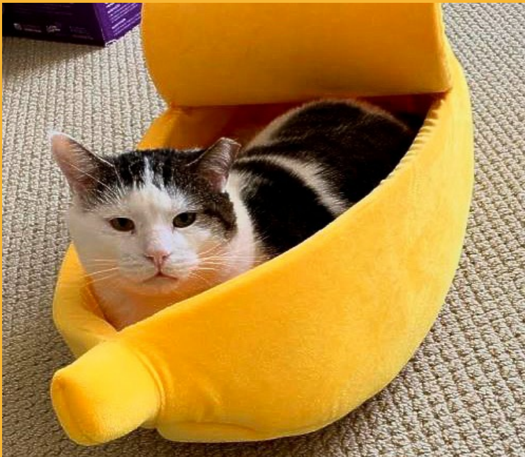
Buddy (FCID# 05/25/18- 141) • Adult • M

View this pet on Petfinder • Fill out an application for Robin (FCID# 01/14/2019 - 513 Brookhaven Foster).