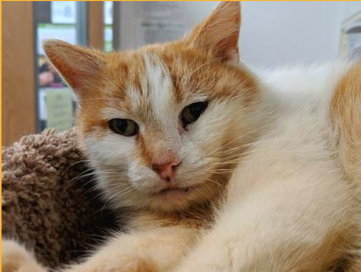
Robin (FCID# 01/14/2019 - 513 Brookhaven Foster) Senior • F

SUPER SENIOR!!! Please extend a warm and welcoming hand to Robin (FCID 01/14/2019-513). She is a sweet female, approximately 8 years old. Robin likes to be petted and be scratched behind her ears.