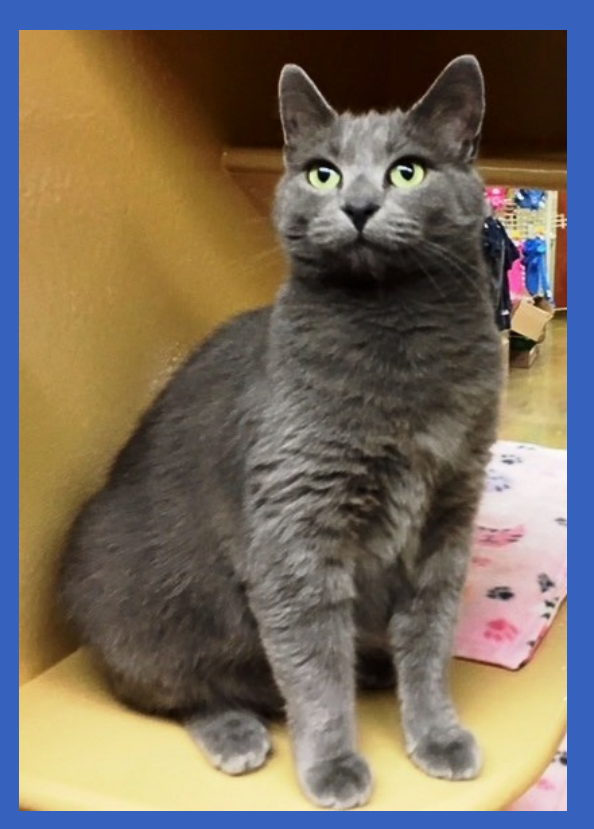
Sparkles (FCID# 11/03/2017-112) Adult • F

Waiting for a quiet forever home since November 2017!!! What a beauty! Sparkles (FCID# 11/03/2017- 112) is a gorgeous gray adult. Sparkles is extremely shy but very sweet once she gets to know you. She likes to sit next to you but not on you. For some reason, she does not like being picked up and can be nippy as a reminder warning. Here is Sparkles's story: A lady begged FC to take Sparkles and her 3 kittens. She said the person who found them was cruel and abused them. Sparkles's foster states that she acts abused; one of the kittens that is now