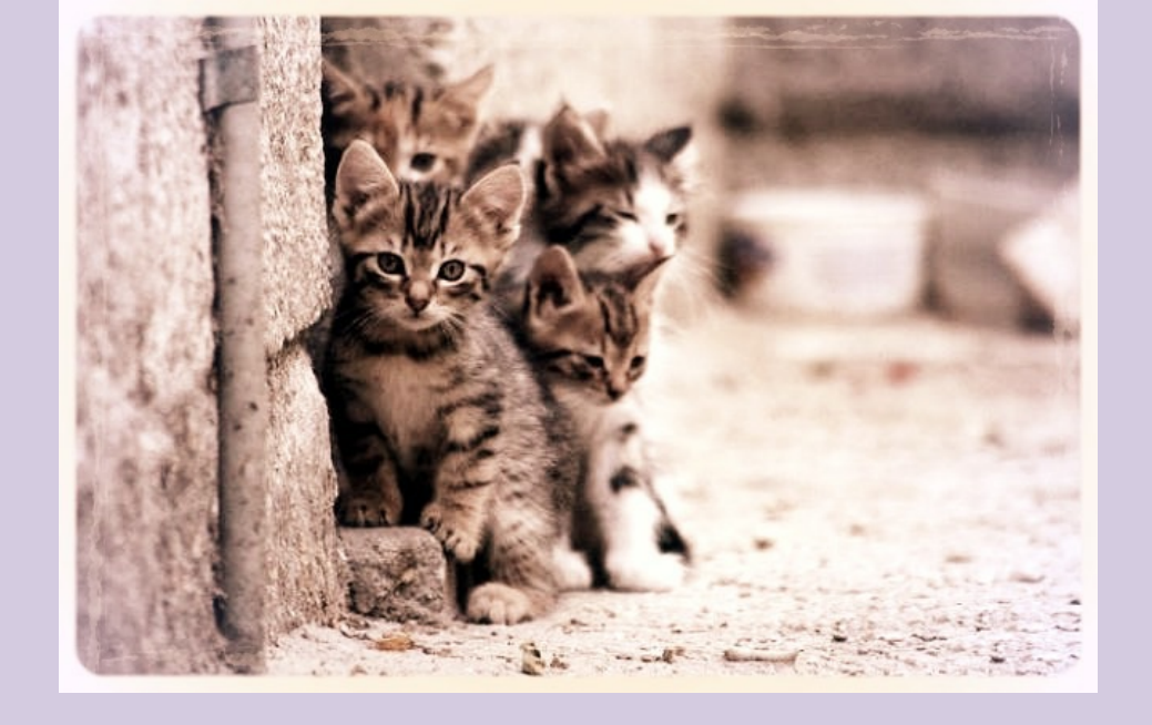
The difference between the kittens shown above living on the streets, and those living in a home can come down to Foster Care.